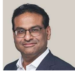
Laxman Narasimhan Chief Executive Officer