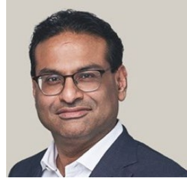
Laxman Narasimhan Chief Executive Officer